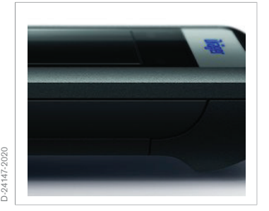
Rubberised handling area for a secure