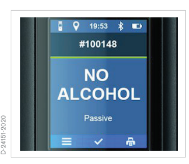
The 2.4" colour display provides information, notices and warnings