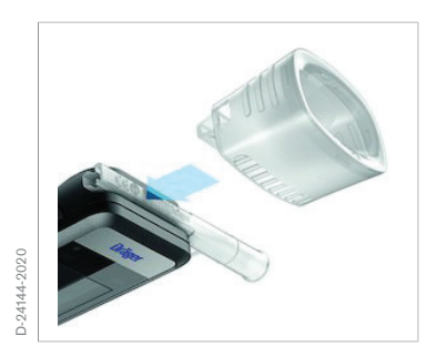
Fast switchover from funnel-based to mouthpiece-based testing